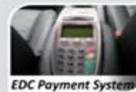
EDC Payment System