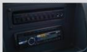
On Ride Entertainment