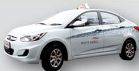
Hyundai Excell-III Total fleets: 100 units

Batik becomes our hallmark, because batik reflects the Indonesian high artistic value; it also represents our dedicated service and high standards for customer. Hospitality and convenience becomes a part of our excellent service. So you do not need to worry to explore the city. It all became so simple in our hands.