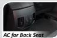
AC for Back Seat