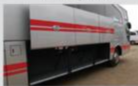
Large Baggage Compartment