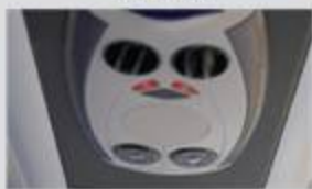
Personal AC + Head Light