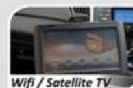
Wifi / Satellite TV